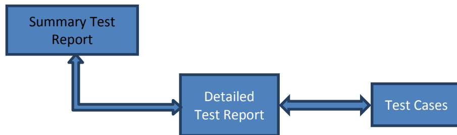
Figure 2.1-1 Templates and Relationships

Three templates are provided. Their names and relationship are shown in figure 2.1-1.